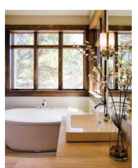
R.D. Building & Design